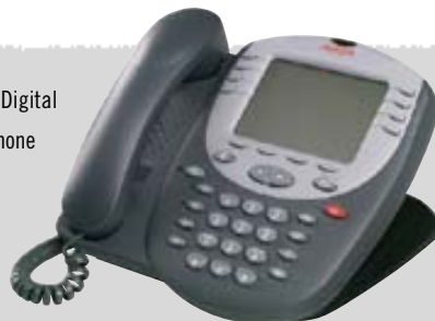
2420 Digital Telephone