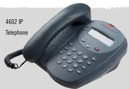
4602 IP Telephone